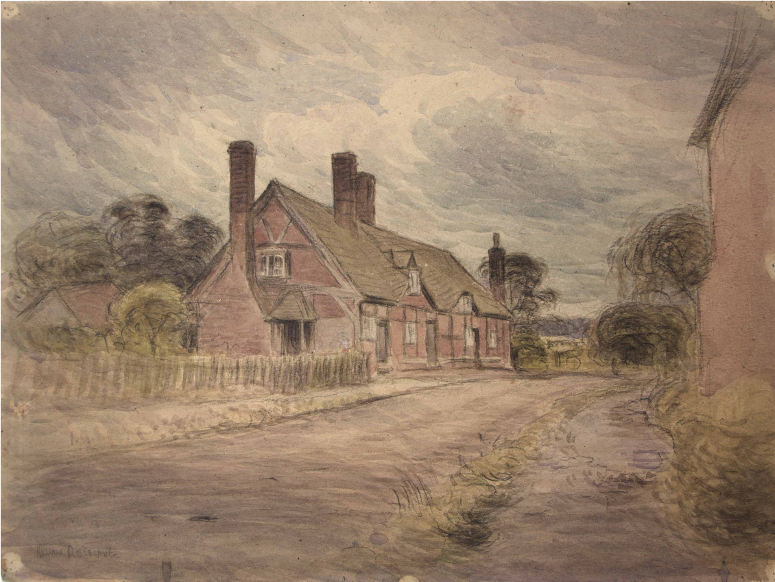
10. 5139, Stoneleigh c. 1939