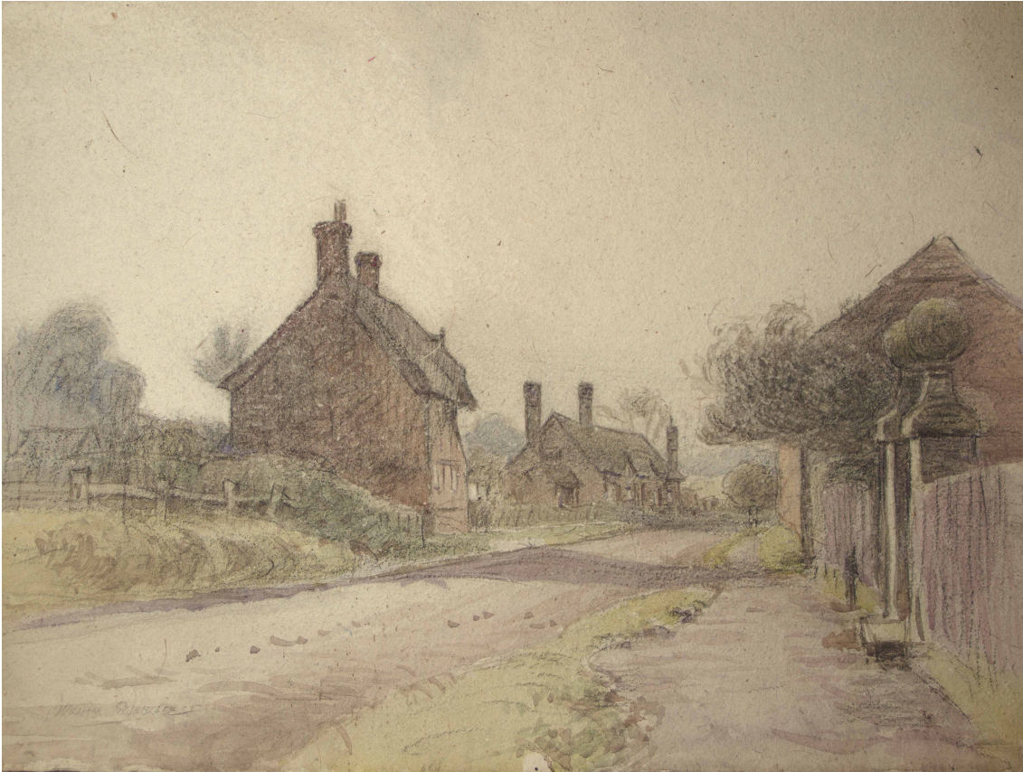
12. 6405, Stoneleigh 1951