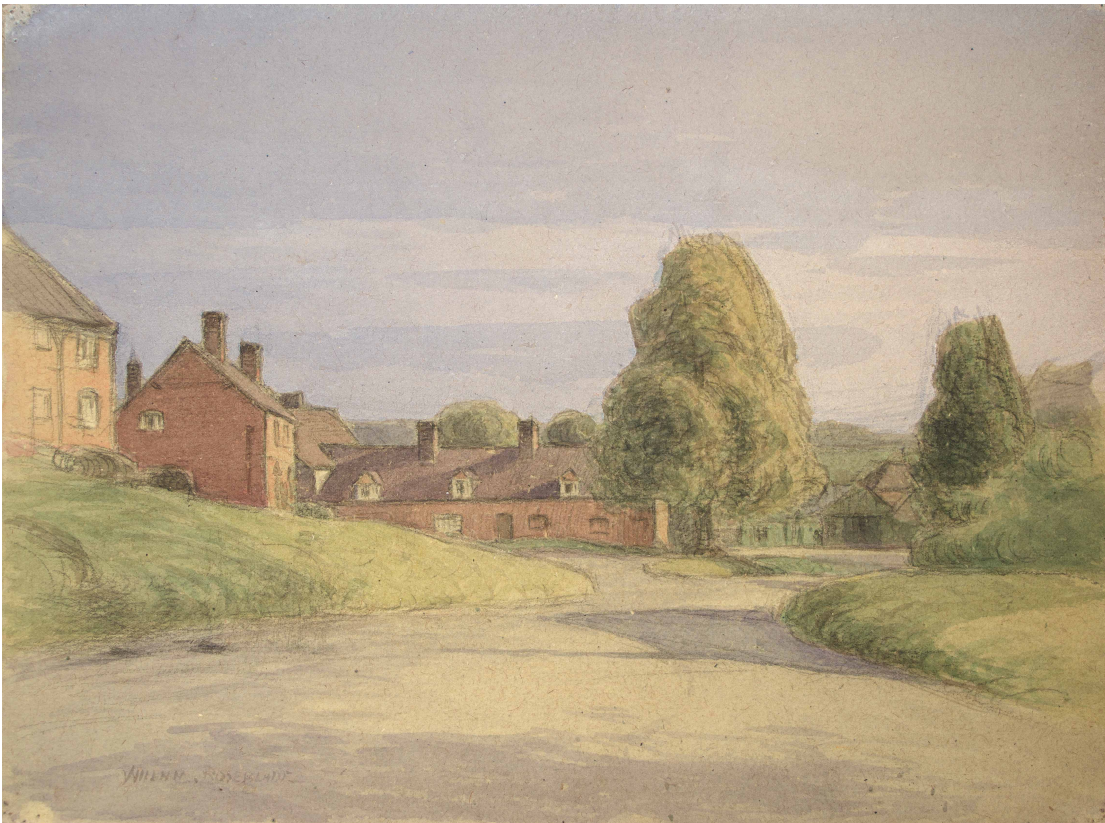
8. 5125, Stoneleigh 1943