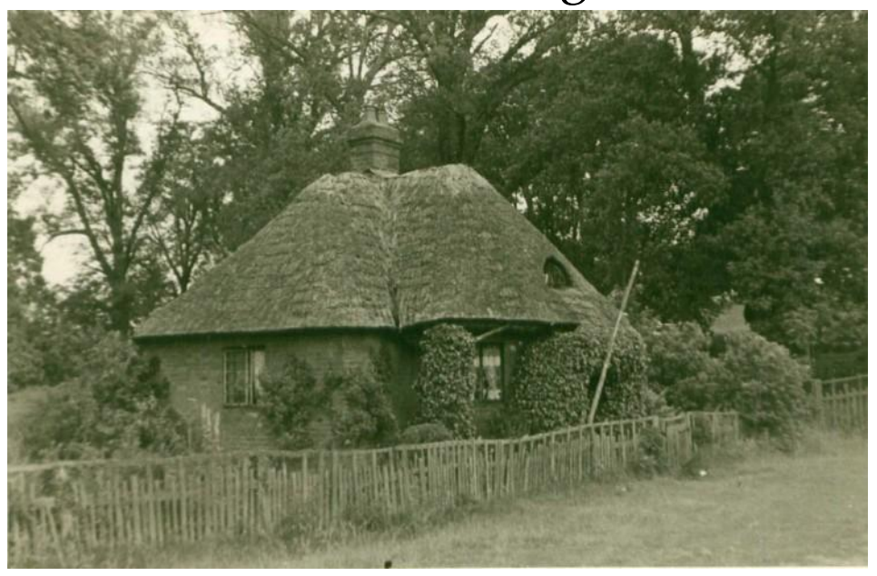
Stareton in 1597