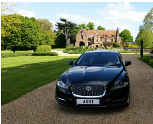
The Australian High Commissioner's Jaguar

First, they were given a tour of Stoneleigh Abbey, after which they came to the village, where the High Commissioner was delighted to see the Australian flag flying – many thanks, Robin! It was good to see their two Jaguars – AUS1 and 1COV – parked outside the Club!