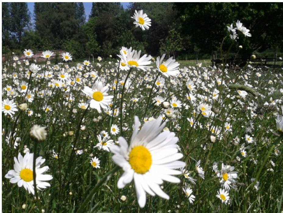
Wildflowers in the Orchard 2015