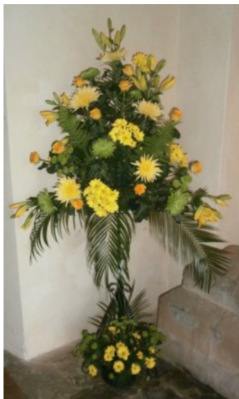
Flower arrangement prepared by the Stoneleigh Church Flower Group for the Australian High Commissioner's visit

Our visitors were then taken around the church before leaving for lunch at Warwick University and a visit to Moat House Farm in Canley, Sir Henry's birthplace, which was part of Stoneleigh Parish in 1815. To conclude, there was a grand dinner at St Mary's Hall in Coventry to round off a special day.