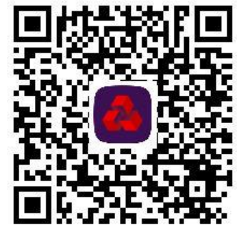
Scan to pay Stoneleigh and Ashow News

Please remember to clear the reference box on the payment page and add your name as the reference so I know who you are