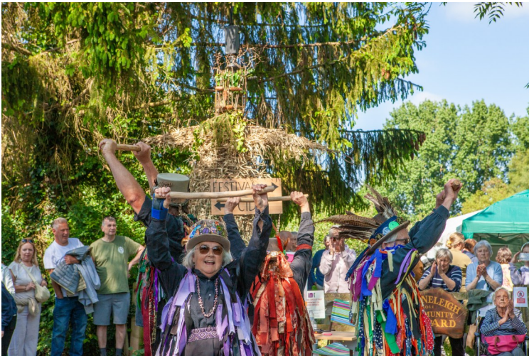
Wicker The Cider Nicker