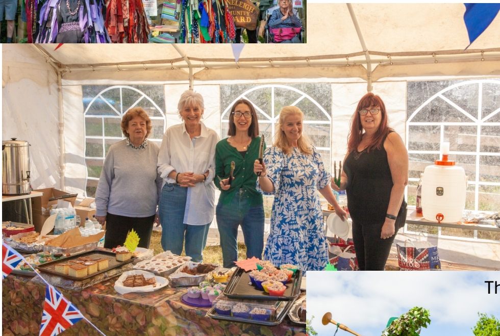
The Refreshment Team