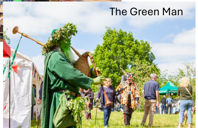
The Green Man