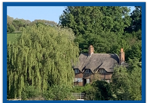
Front cover: Motslow Cottage in the sunshine