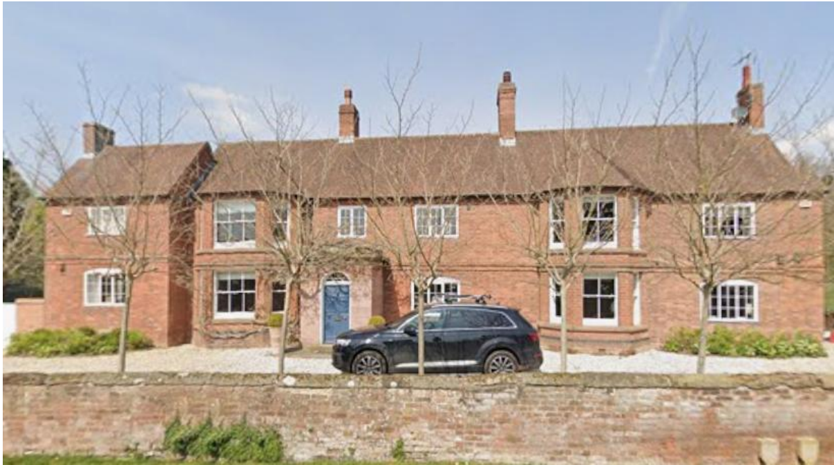
Stareton House, Stareton.