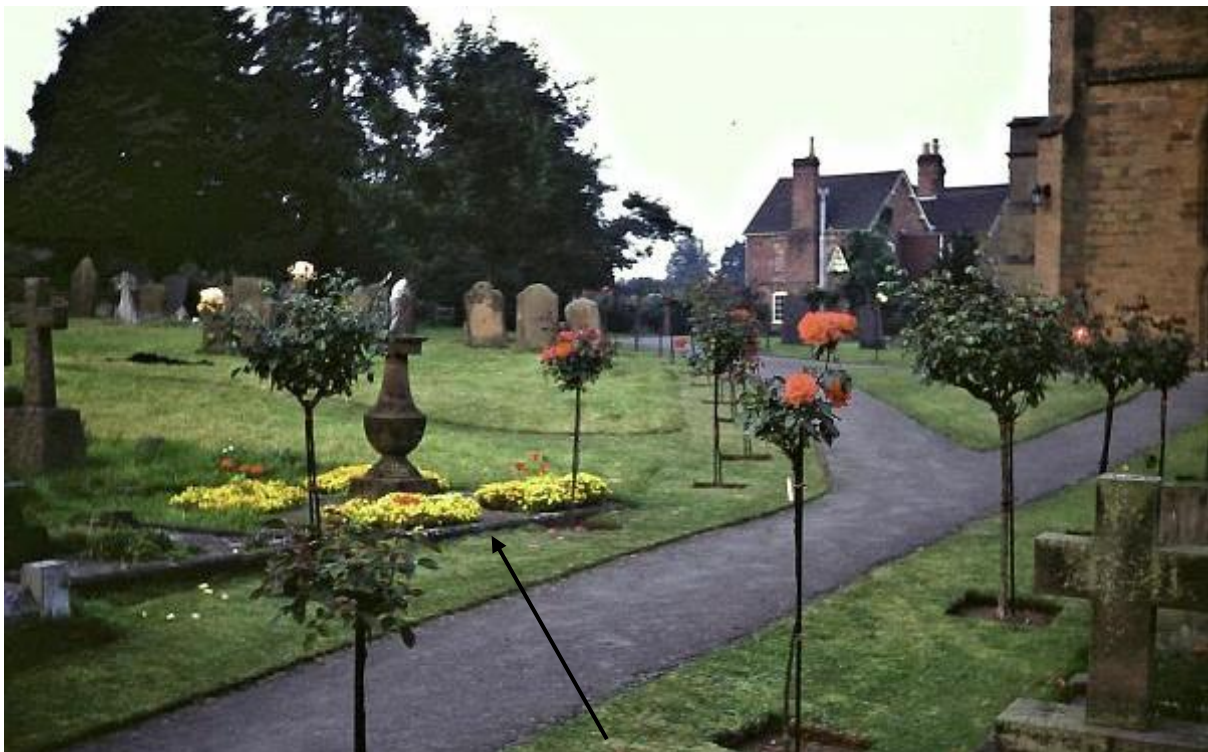
A sundial commemorates the five members of the Pridmore family and serves as their memorial.