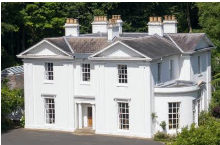
The Birches, Hagley, Stourbridge. A Grade II listed Georgian home set within 19.64 acres.